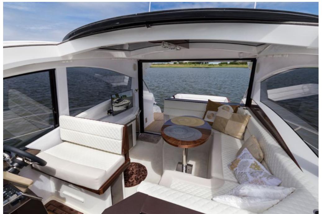
— Open the glass door and drop the window for an open cockpit experience