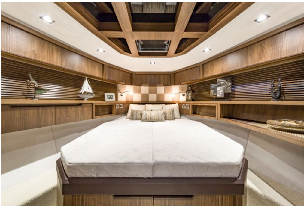
Forward VIP guest cabin with skylights above —