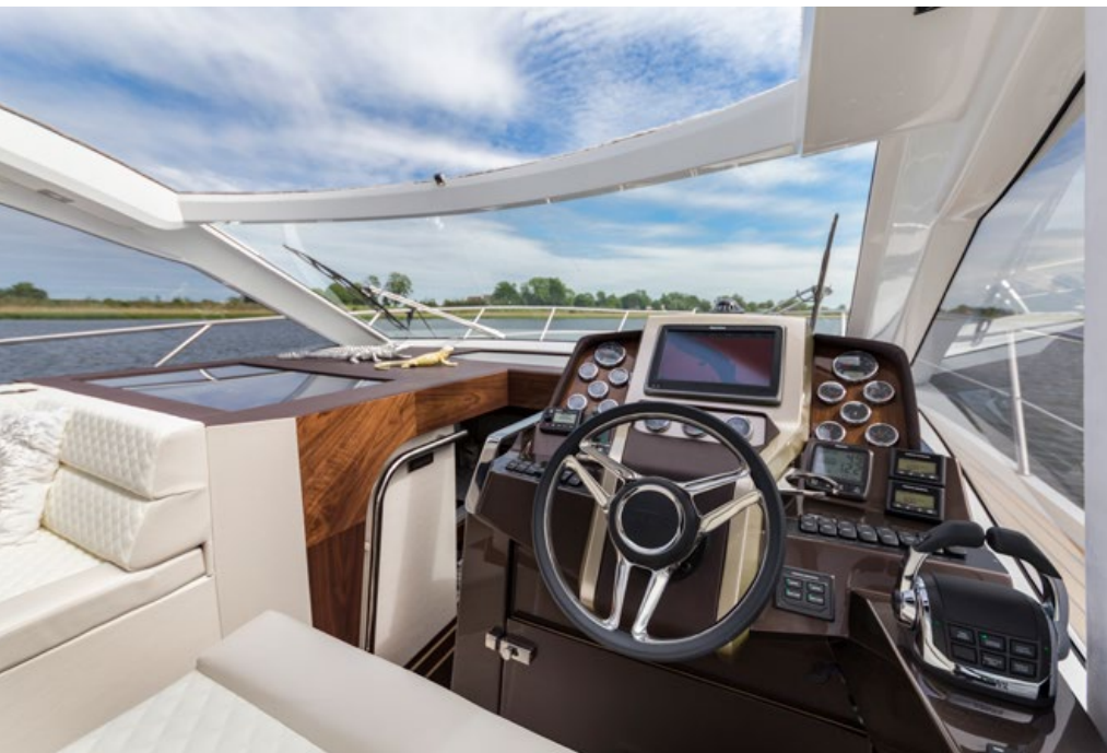
— Slide the sunroof and enjoy the breeze