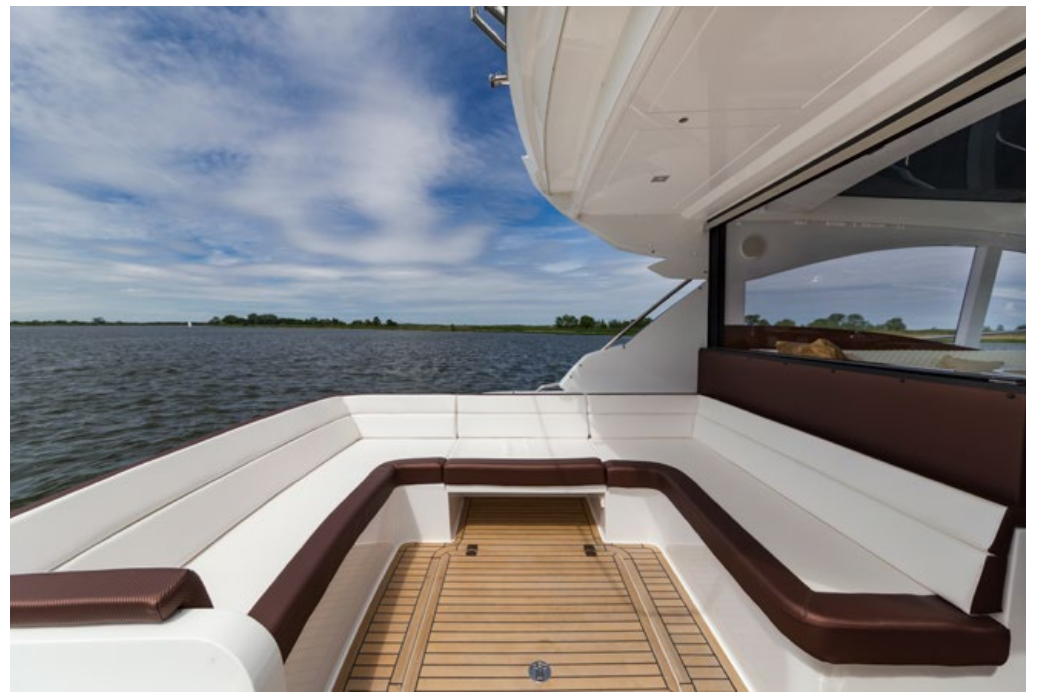
— Outside rest area