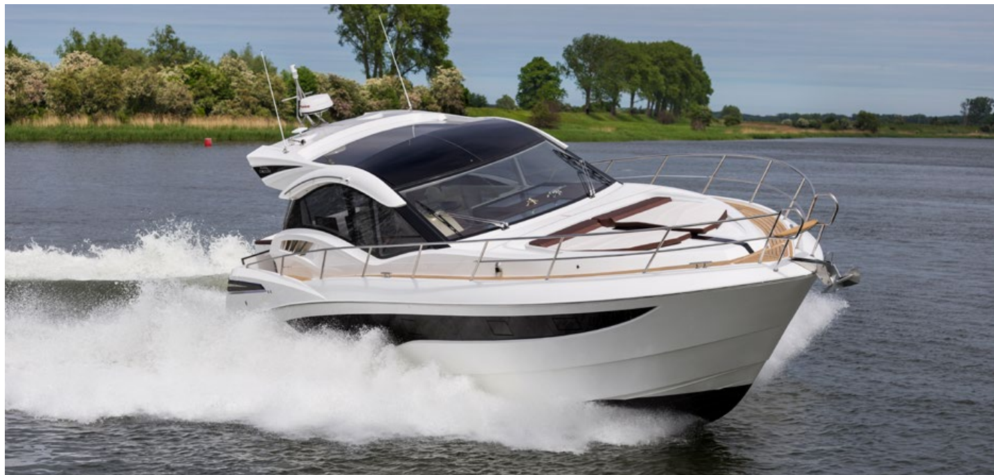
Tight handling and great performance —