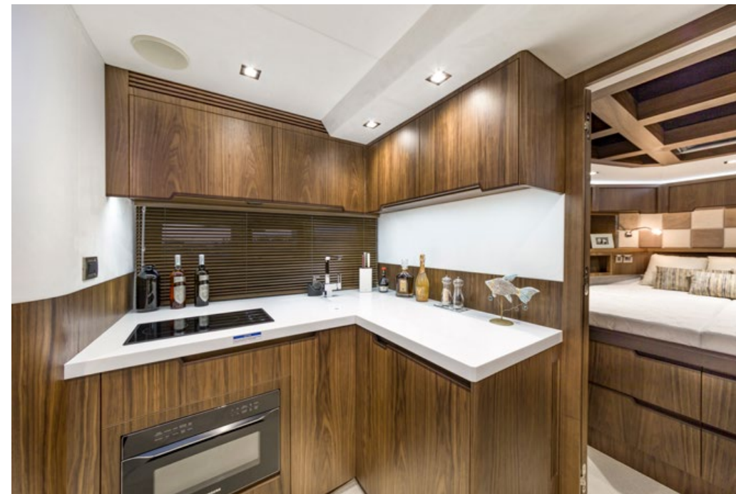
The compact galley will store all the necessities —