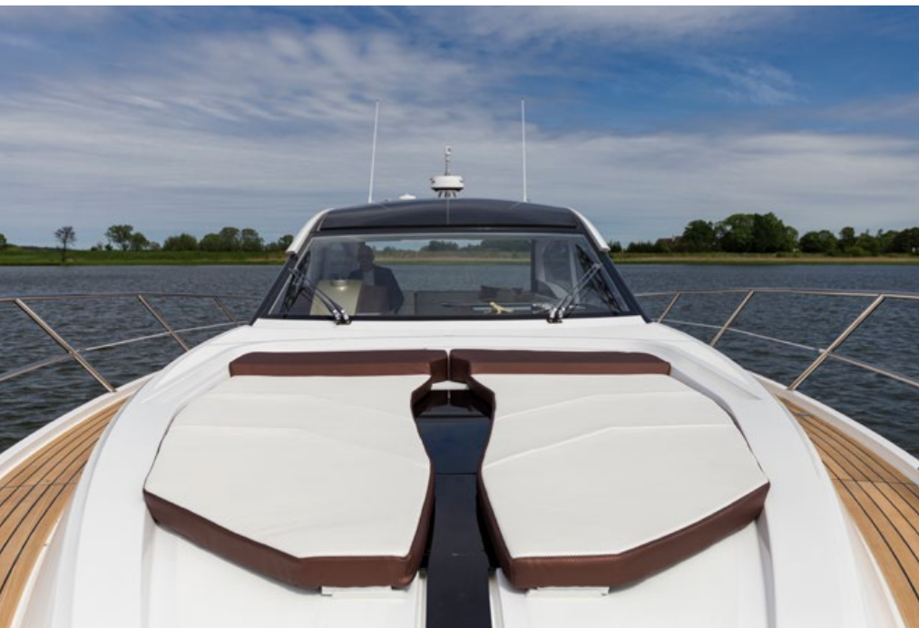
— Bow sundeck area