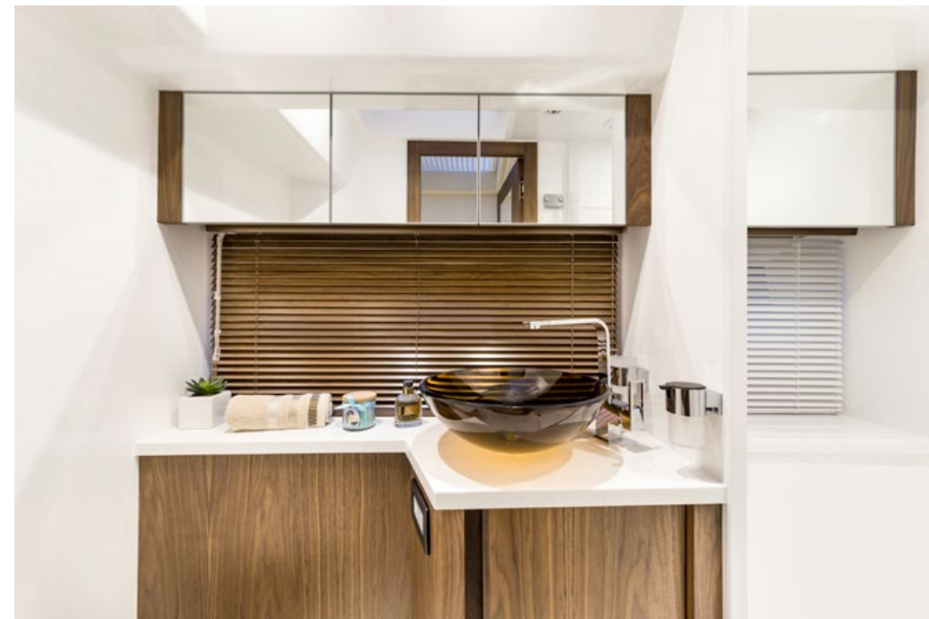
One of the two bathrooms below deck —