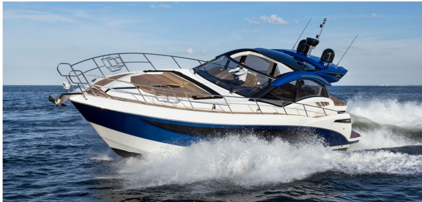
A sporty disposition of the 485 HTS —