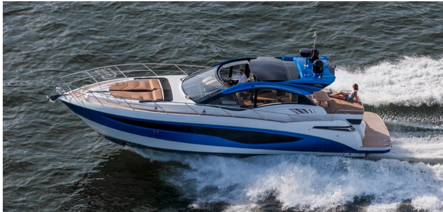
Perfect proportions compliment the sleek design —