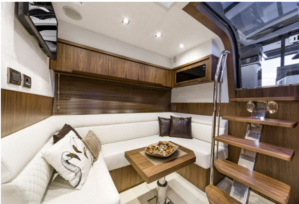
A dinette with a fold-out table —