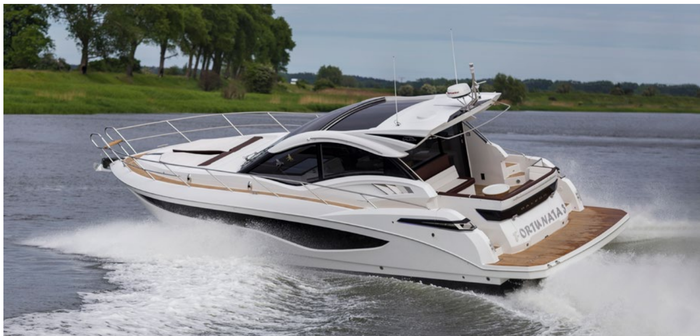
Make use of the available bath platform —